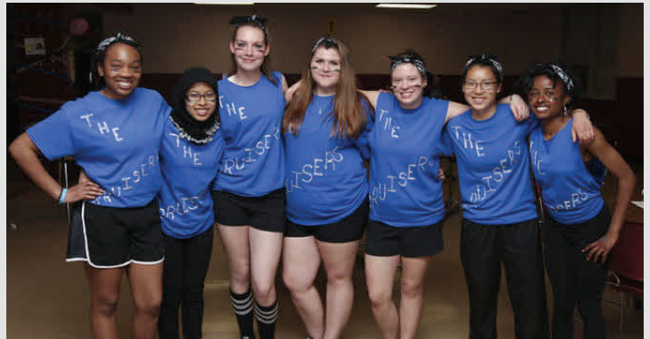
The Bruisers dodge ball team getting ready to play...