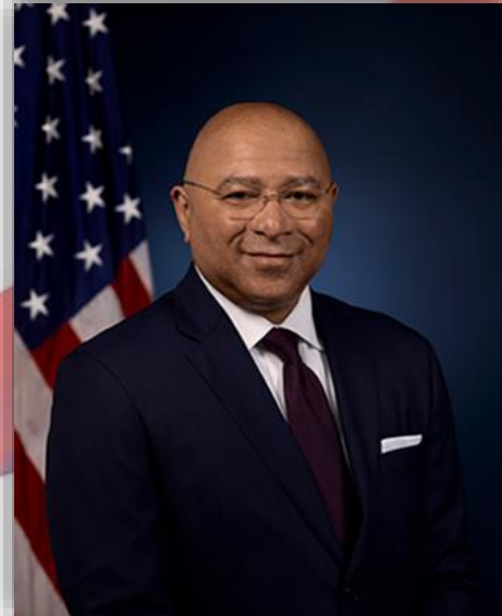
Timothy L. DeFoor Class of 1979 Pennsylvania Auditor General