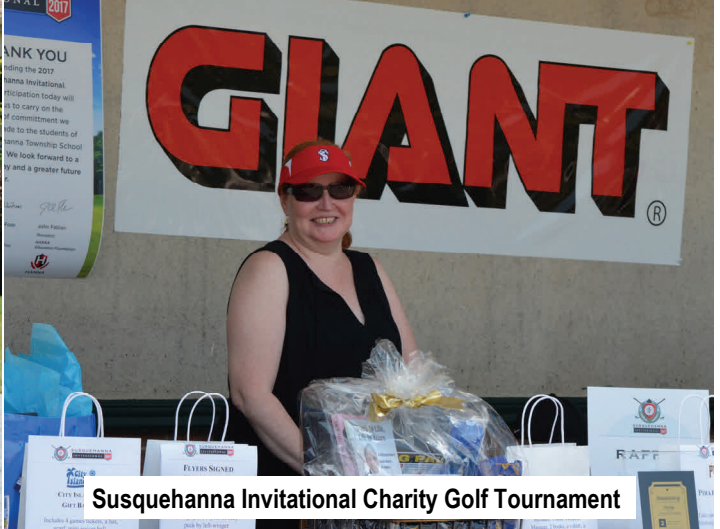
Susquehanna Invitational Charity Golf Tournament