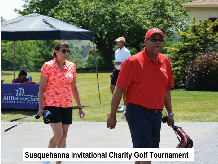
Susquehanna Invitational Charity Golf Tournament