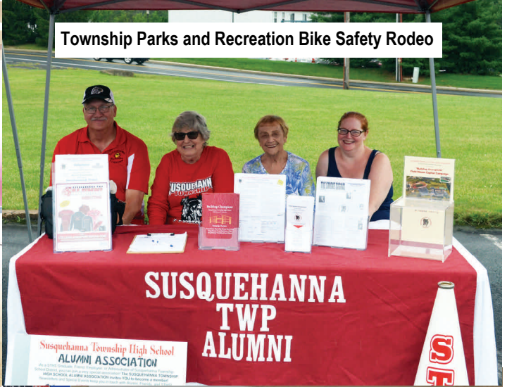
Township Parks and Recreation Bike Safety Rodeo