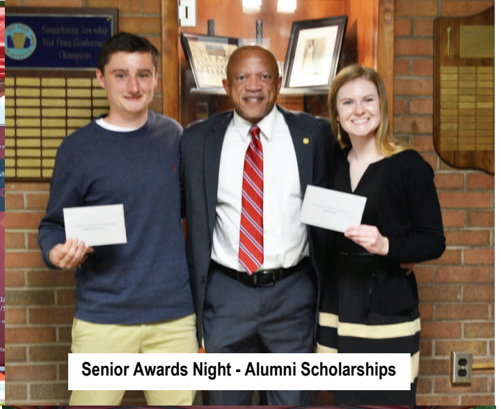
Senior Awards Night - Alumni Scholarships