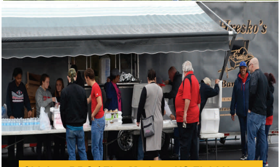
Chicken BBQ / Flea Market - HS Field House