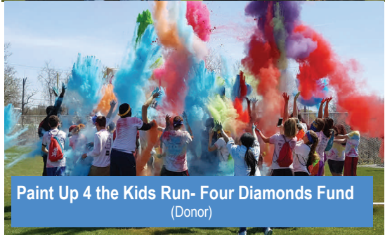
Paint Up 4 the Kids Run- Four Diamonds Fund (Donor)