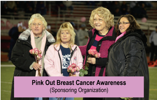
Pink Out Breast Cancer Awareness (Sponsoring Organization)