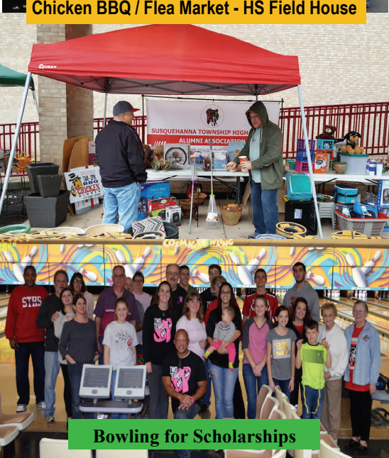
Bowling for Scholarships