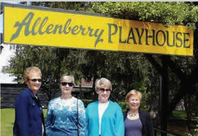
The "Harrisburg Honeys", Class of 1958