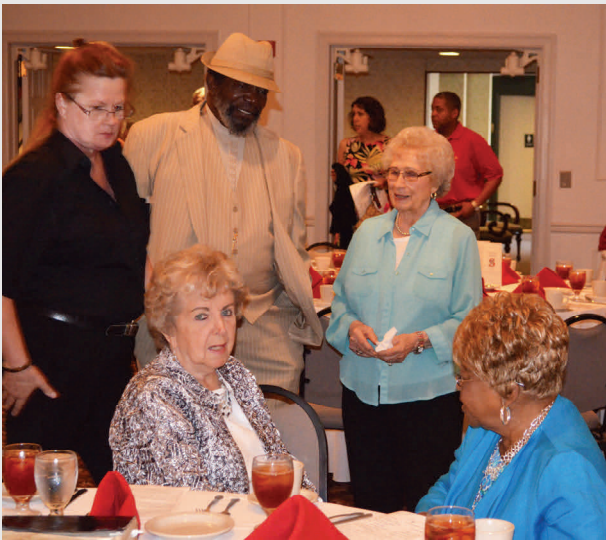
24th Annual Banquet- June 28