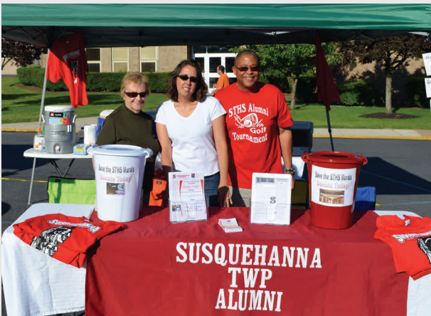
Community Carnival- June 17-21